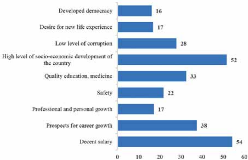
Figure 2. Motives for moving abroad for permanent residence

in the destination country. Career advancement opportunities (38%), access to quality education and healthcare (32%), and lower levels of corruption (28%) were also identified as significant factors influencing decisions to migrate permanently. Furthermore, the study highlights a preference among highly qualified Kazakhstani specialists for countries like the USA, Great Britain, and Canada. The analysis also suggests that prior work experience abroad, studying in the UK, and residing in Kazakhstan’s suburban areas increase the likelihood of permanent migration.