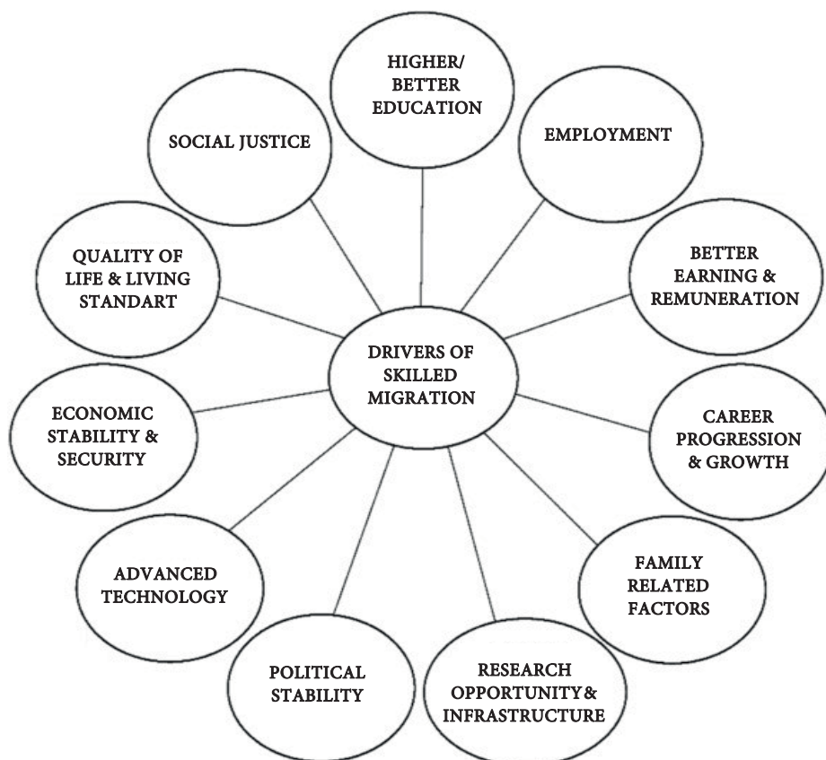
Figure 1. Drivers of skilled migration

A complex interplay of factors drives intellectual migration from Kazakhstan, categorised as push factors within the country that incentivise emigration and pull factors offered by destination countries. The most comprehensive overview of drivers and motivations of skilled migration is represented in Figure 1 as a result of a systematic literature review by Bhardwaj and Sharma. 29