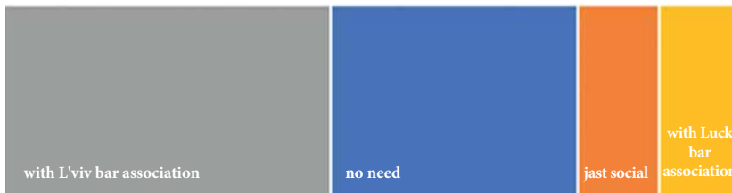
Figure 4 Cooperation of Polish-Ukrainian bar associations

fulfil various legal obligations, and conduct their own international activities. Additionally, at the central level, there are supreme organisations and other self-governing bodies whose task is to supervise, support, and coordinate regional organisations. Nevertheless, it is the regions that carry out most of the tasks and responsibilities. In both Poland and Ukraine, lawyers and legal advisers are obliged to become members of the bar association. Regional and supreme corporate bodies conduct activities of an international nature, which result from the provisions of national or international law (e.g., maintaining lists of foreign lawyers, cross-border disciplinary proceedings), or the ambitions of members of boards of directors (councils) of regional associations (e.g., organisation of international training, conferences, internships, representation in international organisations, promotion of cross-national issues, or international social events). 38